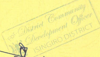
Turibamwe Silver For. DISTRICT COMMUNITY DEVELOPMENT OFFICER